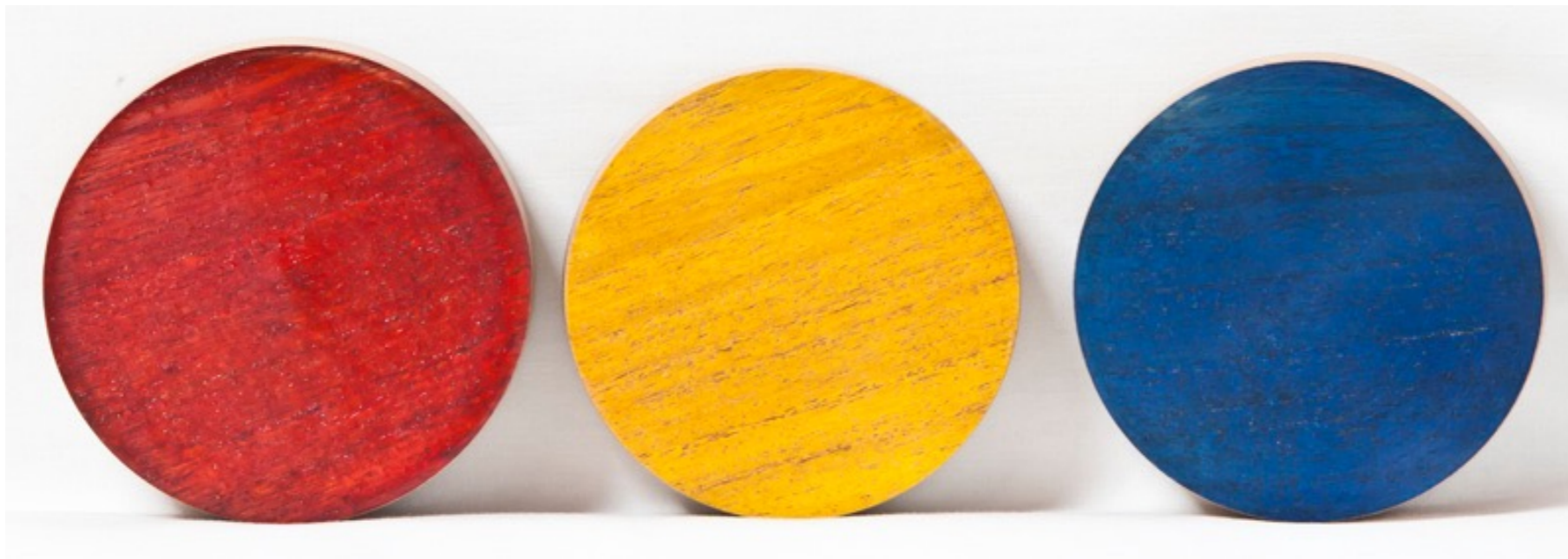
Artisan Premium Coloring Dye on Maple